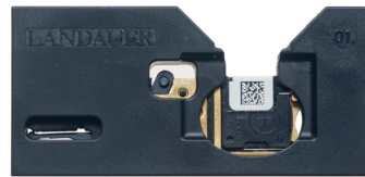
nanoDot carriers slide in and out of the adapter (2D bar code facing front) for read-out in a microStar reader.

nanoDots are the most effective tool to comply with existing or emerging patient dose monitoring regulations, and provide an inexpensive insurance policy to mitigate litigation risk for your facility.