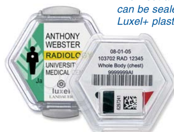
The Neutrak 144 dosimeter can be sealed inside the Luxel+ plastic blister pack.