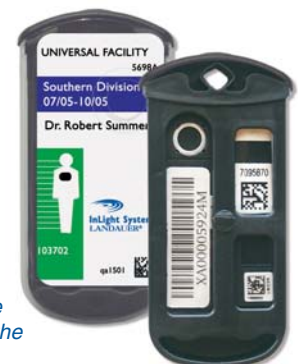
The Neutrak 144 dosimeter can be enclosed inside the InLight holder.