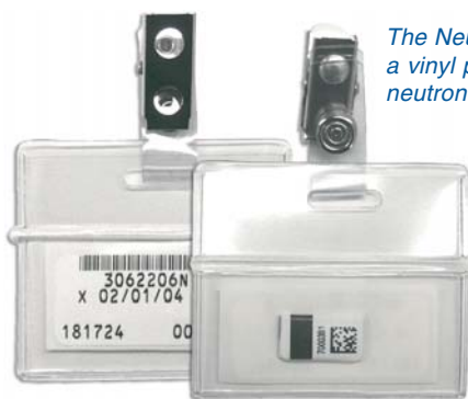
The Neutrak 144 packaged in a vinyl pouch specifically for neutron detection only.